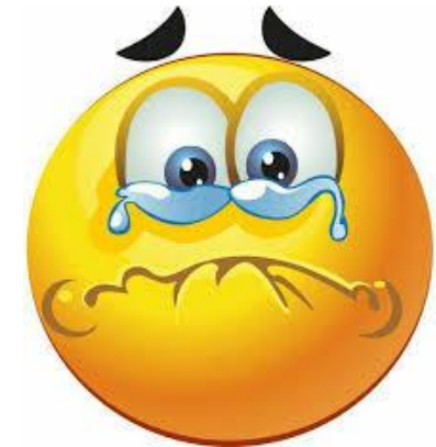
Not Effective QMS